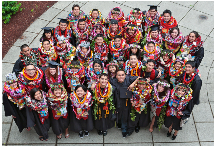
Congratulations Class of 2013

Pacific University 2043 College Way Forest Grove, OR 97116 Web: www.pacificu.edu Toll free: 1-877-PAC-UNIV