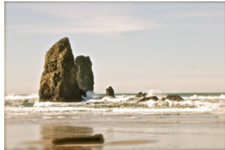
Cannon Beach, OR